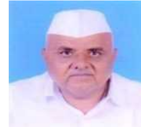
The CHITNIS Hon. Shri. Dilip Sakharam Dalvi