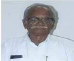
The UPSABHAPATI Hon. Shri. Deoram Baburao Mogal