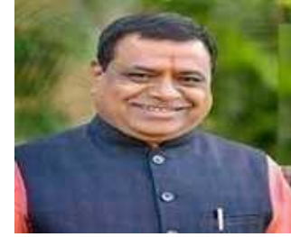
The SABHAPATI Hon. Shri. Balasaheb Ramnath Kshirsagar