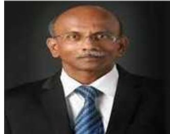
The SARCHITNIS Hon. Adv. Nitin Baburao Thakare