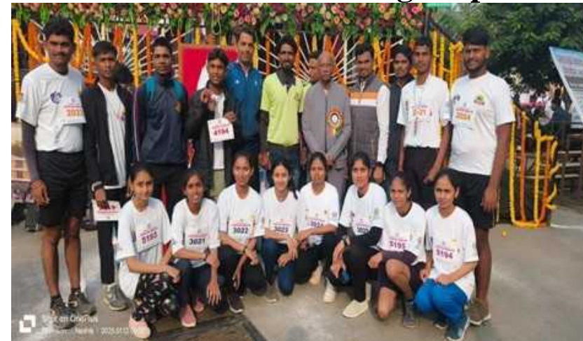
Grand Alumni 2025-26