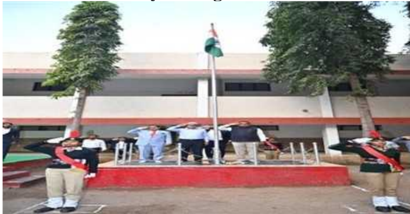
Celebration of Day 15 August