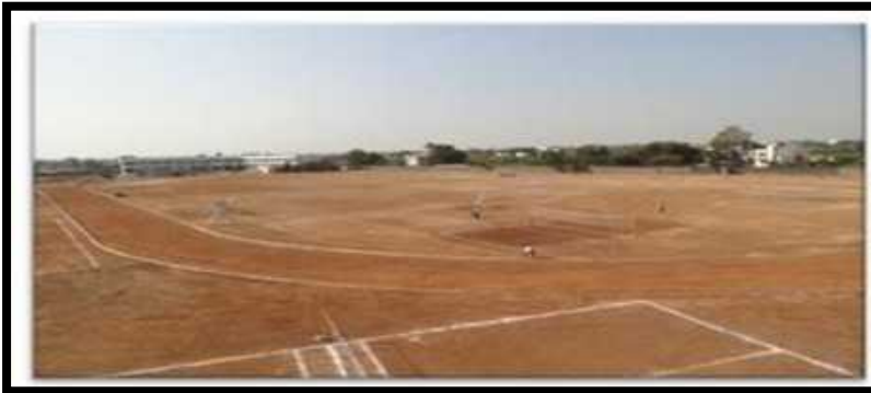
Running Track Foot Ball